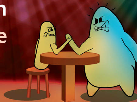
Parasite vs Host